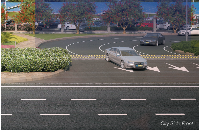
City Side Front

At the altar of the land of the mighty Brahmaputra and Maa Kamakhya Devi, the New Integrated Terminal Building at Guwahati International Airport is an ode to the ancient yet reinvigorated spirit of Assam, the Seven Sisters, and our own Incredible India. It is the collective dream and effort of a team of fifteen consulting and design firms, including Aecom, Design Forum International, Integral Designs, Axis Facades, Gaurav Jindal, Alpana Khare Designs and CBRE.